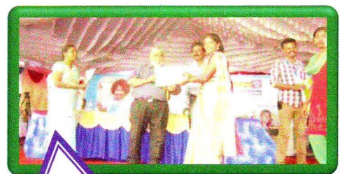
Our Price Winners